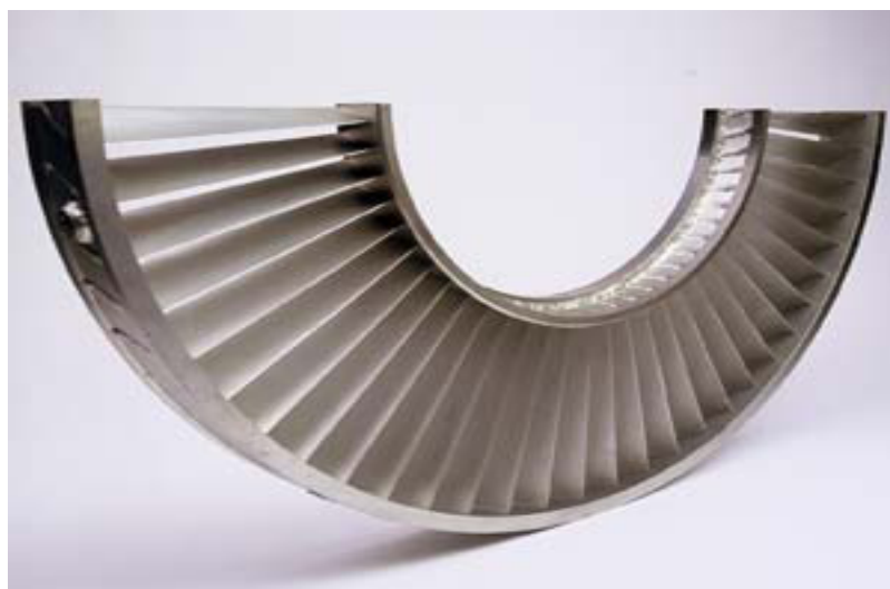
We specialize in Diaphragm Repair!